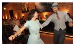
Line & Swing Dance Lessons Included